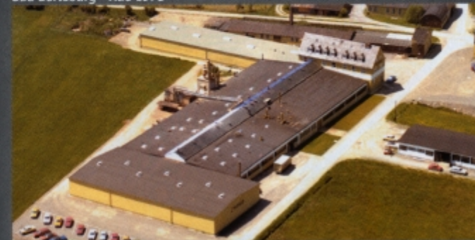
Bad Berleburg - Aue 1975