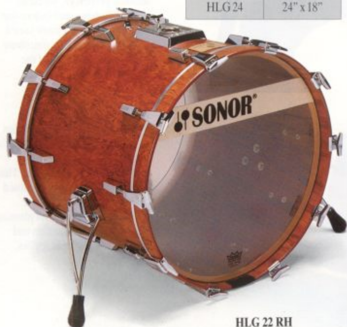
HLG 22 RH