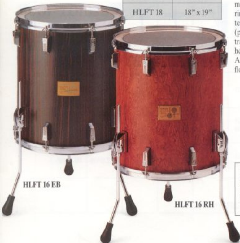
HLFT 16 EB