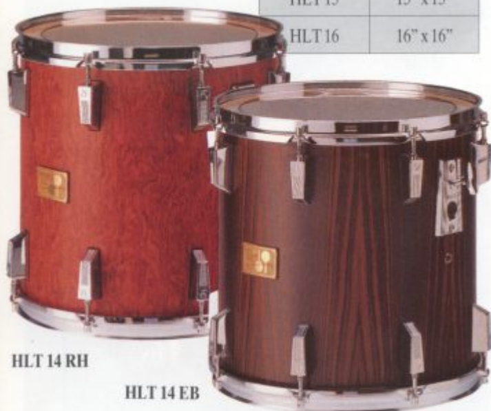
HLT 14 RH