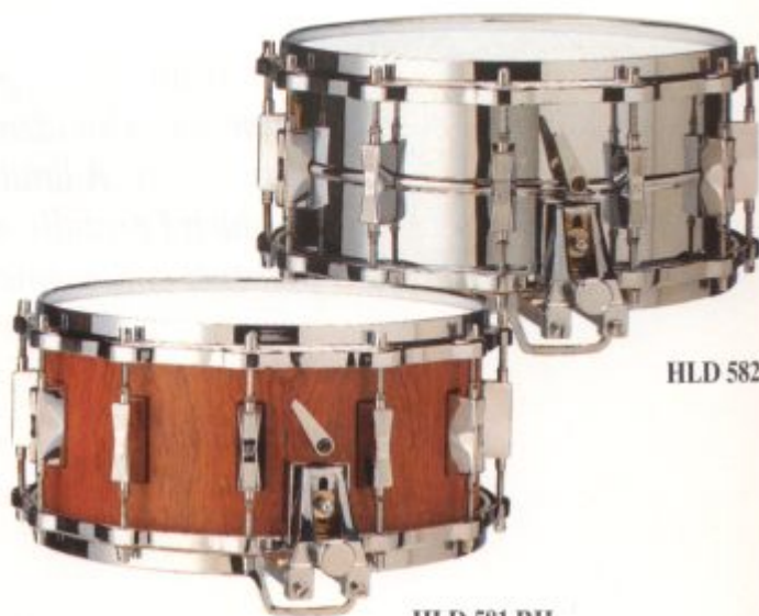
HLD 581 RH