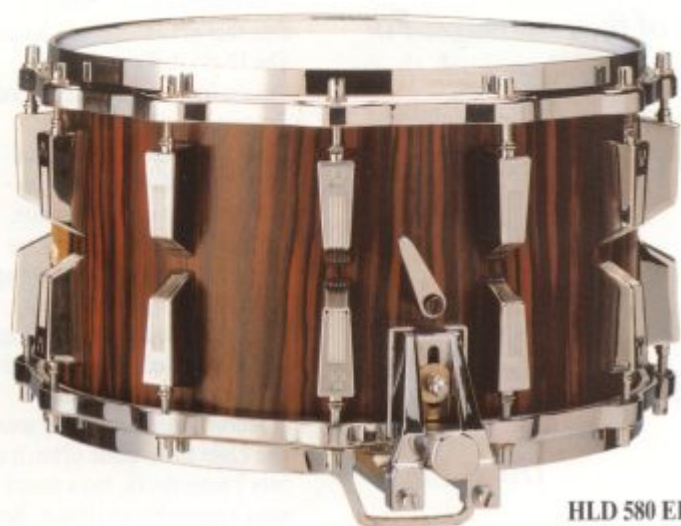
HLD 580 EB

24 tensions screws with "Snap-lock" (pat.) system, oscillographically tuned batter and snare heads, adjustable external muffler.